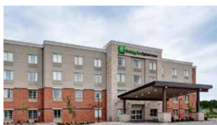
HOLIDAY INN EXPRESS