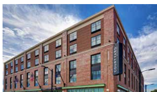
COURTYARD BY MARRIOTT