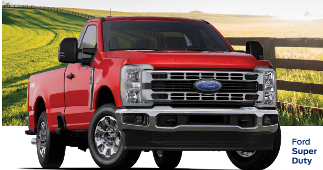
Ford Super Duty

Farm Bureau Members receive $500* toward an eligible new F-150® Lightning®, Super Duty®, F-150, Ranger® or Maverick®.