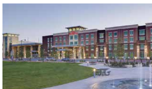
HILTON GARDEN INN