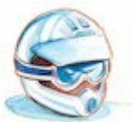
Approved helmet with eye protection